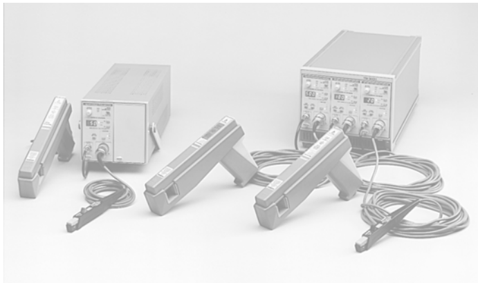
AM503 Current Measurement Family

To receive a calibration and/or repair quote-RMA from R.A.E. Services Inc. Click here>> www.raeservices.com/services/quote.htm