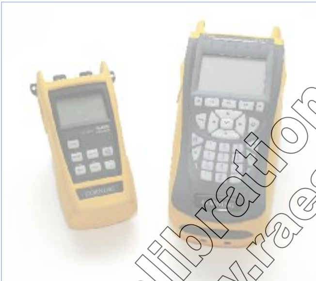
OTS-600 Series Light Source and Power Meter | Photo LAN1195

The USB data ports provide convenient transfer of data to OTS-View Windows®-based PC Software for storage, viewing and printing of test results. The OTS-600 Series units have data storage for up to 10,000 measurement results, USB data transfer interface and a video inspection probe port. Both the OT-600 and OS-400 Series units come standard with a 650 nm visual fault locator (VFL) for convenient troubleshooting of optical networks. The OTS-600 Series units are sold individually, and as test kits. These kits include two units, an SC source adapter, and SC, LC, and ST® Compatible Connector meter port adapters. The kits are packaged in a hard case for convenient storage and protection during transit.