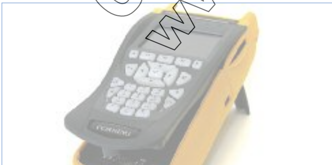
Modular Screen and Keypad | Photo LAN1190