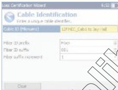
Screen Shot of Step 3

Step 6: During the testing, the results are shown in tabular format making it easy for the user to view results. The table conveniently shows any saved data for that fiber, making reviewing and updating results simple and efficient.