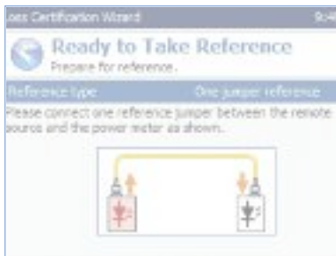
Screen Shot of Step 2

Step 1: User selects test standard which will be used to calculate pass/fail thresholds. User can also create and save their own custom criteria where they define the connector pair loss in dB, splice loss in dB and cable loss coefficient in dB/km.