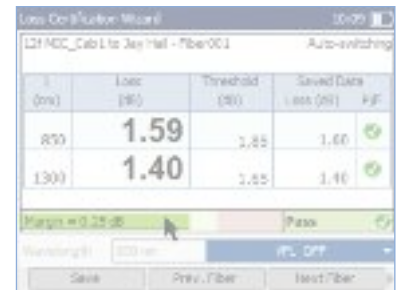
Screen Shot of Step 6